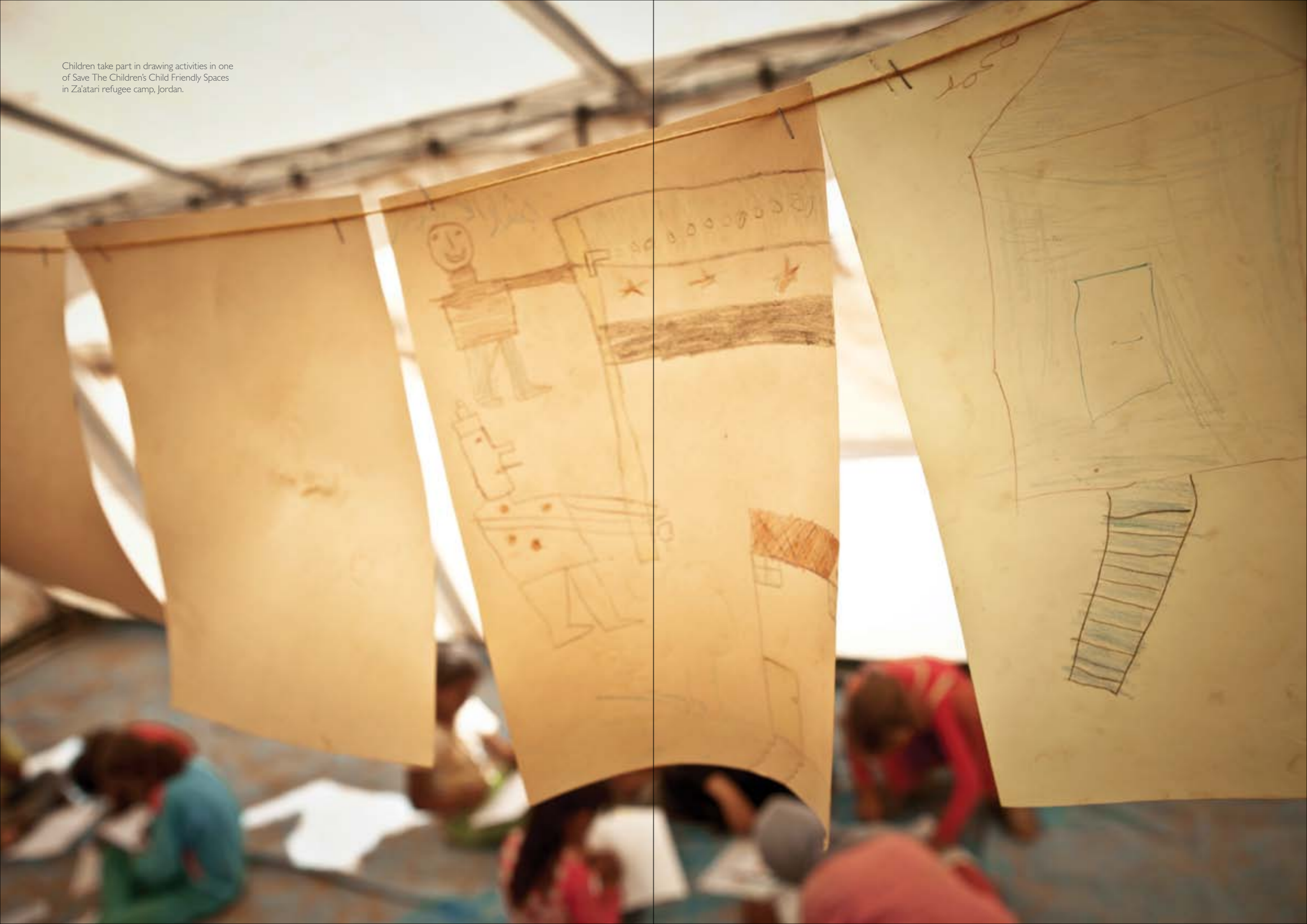
Children take part in drawing activities in one of Save The Children's Child Friendly Spaces in Za'atari refugee camp, Jordan.