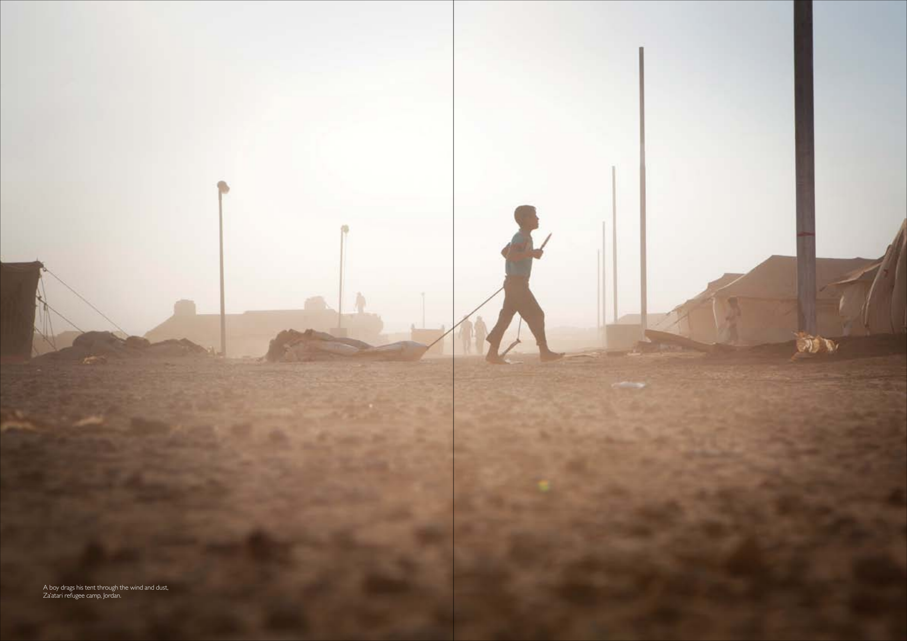
A boy drags his tent through the wind and dust, Za'atari refugee camp, Jordan.