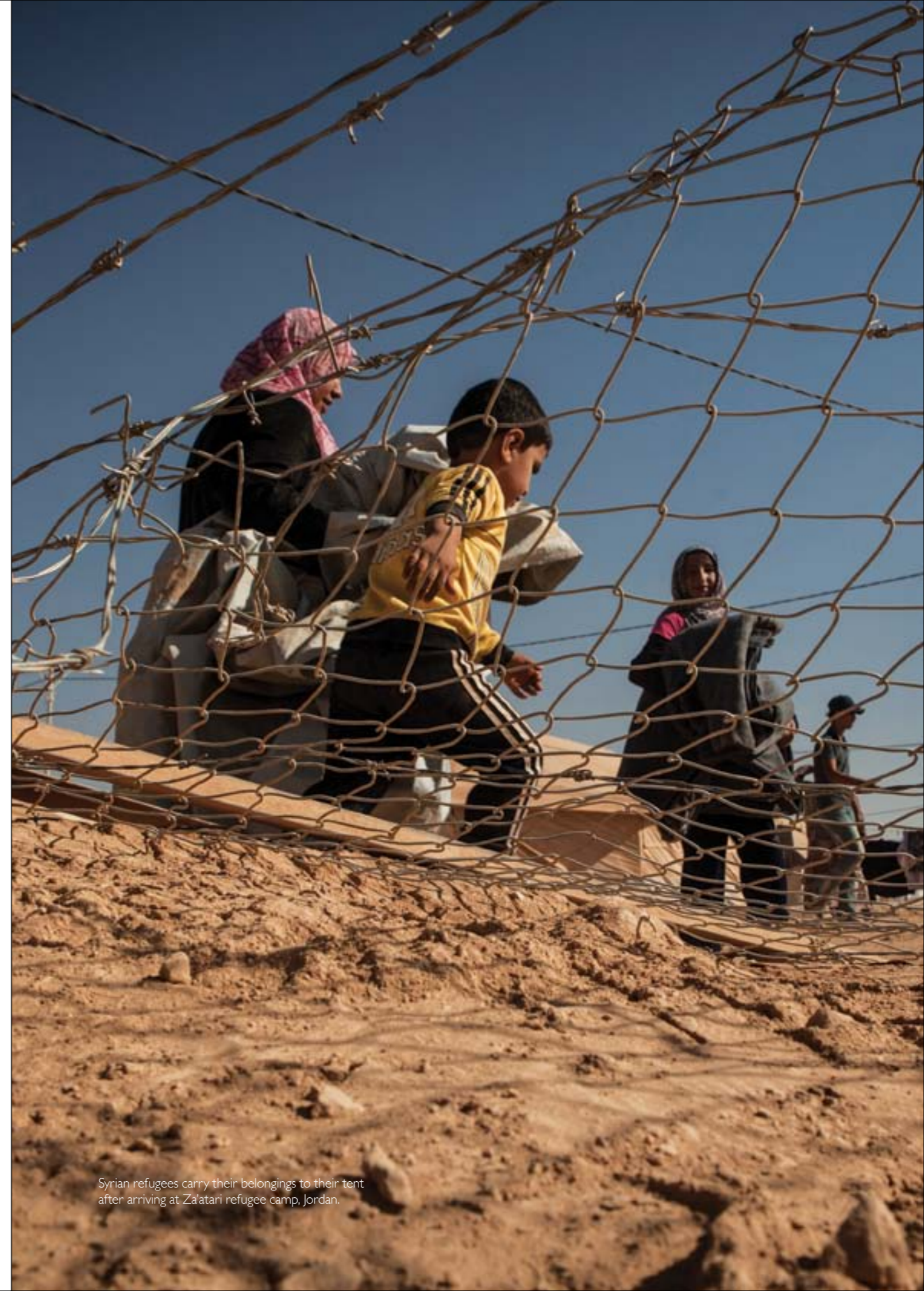
Syrian refugees carry their belongings to their tent after arriving at Za'atari refugee camp, Jordan.

Now, in my sleep, my friends tell me that I shout for my mother and sometimes scream “Leave me alone! Leave me alone!”